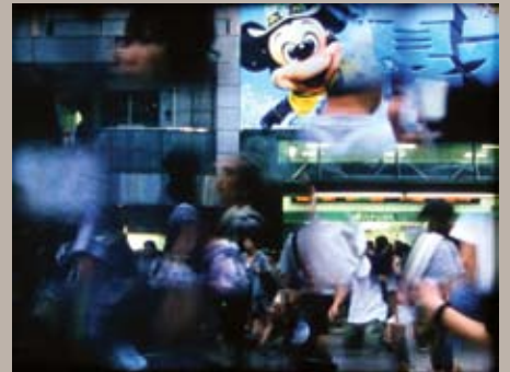
A still from the film, "Shibuya - Tokyo."